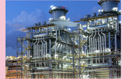
A top-tier 1,300MW gas-fired power plant in Singapore

Acquisition of 51% interest in Keppel Merlimau Cogen Pte. Ltd. (“KMC”) funded by Equity Fund Raising Exercise